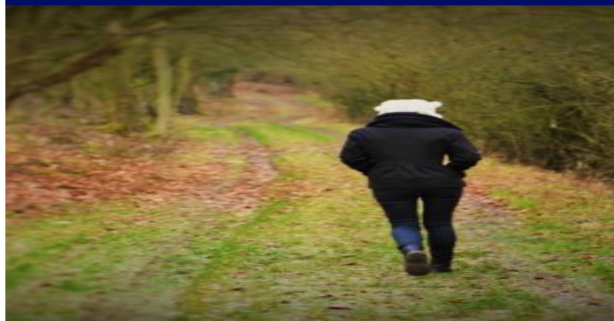
HOW WE CAN HELP