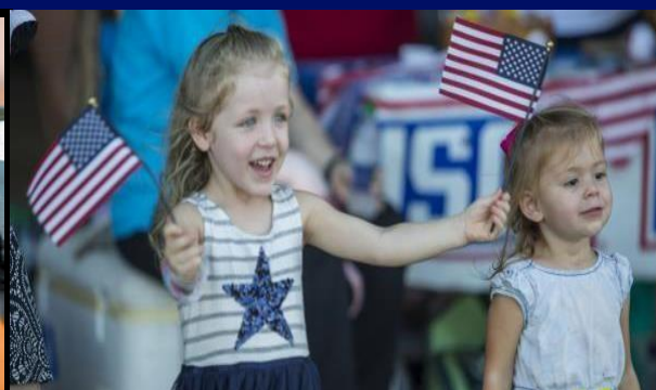
NEED TO KNOW

The School Liaison Program is the critical link between families, commanders, communities, and schools to improve educational outcomes, quality of life, and operational readiness.